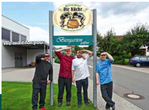
3 chefs and one prospective chef do their very best.