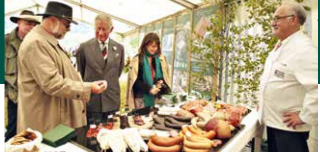
A Royal Visit: Prince Charles consulting with his administrator about the concept of the association of farmers.

The association of farmers consists of a group of farms in the Hohenlohe region. In 1988 the association started producing healthy foods, taking responsibility for nature and wildlife and allowing for the benefit of our local consumers.